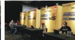
Investor Speed Dating