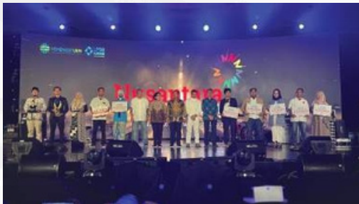
Best Incubator LPDB 2022

Partner of Dinas Koperasi dan Usaha Kecil Jawa Barat in conducting Delta Incubator Program 2023 – Present