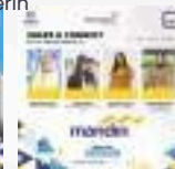
Nusantara Deals Club