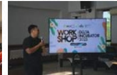
Delta Incubator Program